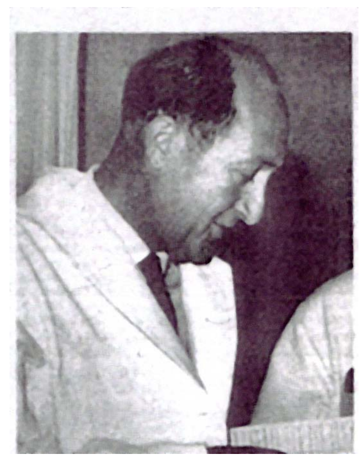
PROFESSOR JEPSON ON WARD ROUND WITH STUDENTS (1965)