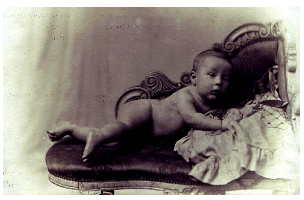
AS A BABY IN CLITHEROE