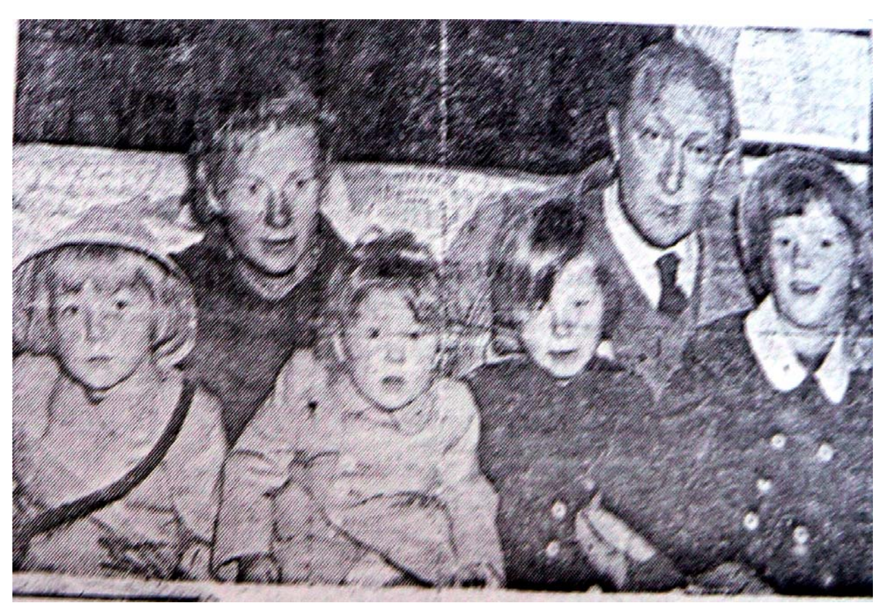
PHOTOGRAPH OF THE JEPSON FAMILY ON ARRIVAL IN ADELAIDE. PUBLISHED IN THE LOCAL NEWSPAPER