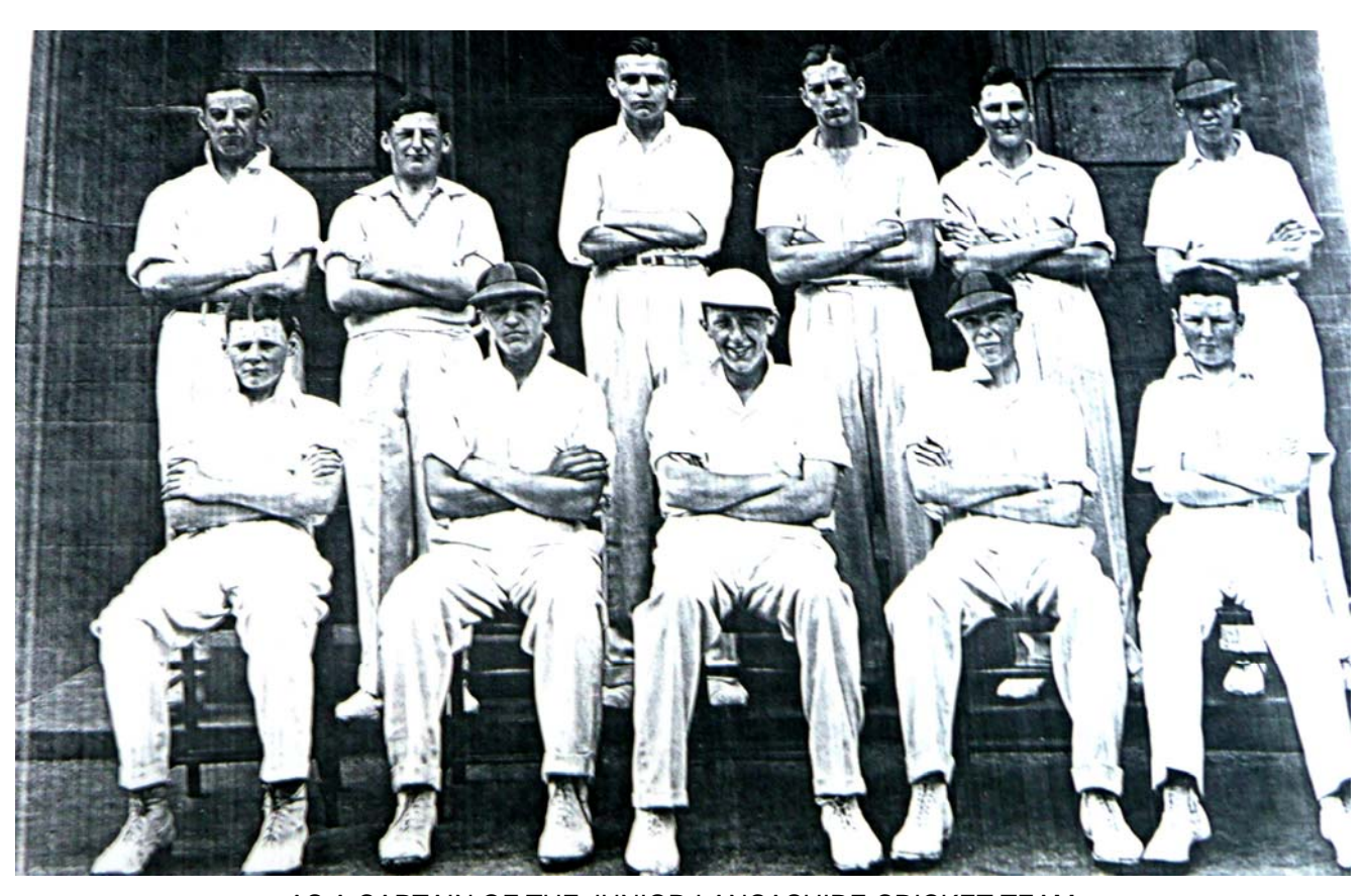
AS A CAPTAIN OF THE JUNIOR LANCASHIRE CRICKET TEAM